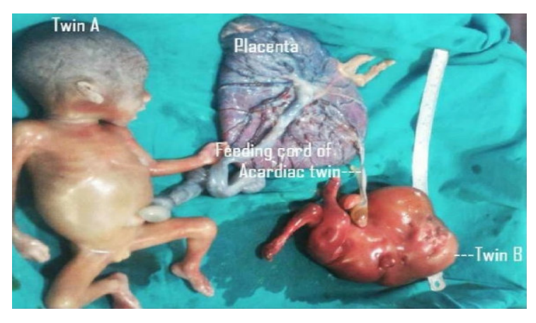
Figure 3: Gross photograph showing Twin A grossly normal foetus and Twin B replaced by amorphous structure with double vessels cord of Twin B attached directly to placenta and anastomose with arterial vessels of Twin A

But limited availability of centres for these techniques and also skills makes it difficult to undertake these procedures. On this backdrop, the best strategy remains always early diagnosis and early prophylactic intervention to avoid technical difficulties at late interventions. Early pickup of cases of TRAP sequence by sonography, will allow the clinician to choose appropriate method of foetal reduction and allow the normal growth of pump twin to be beyond 36 weeks without any compromise [1, 2, 10, 11].