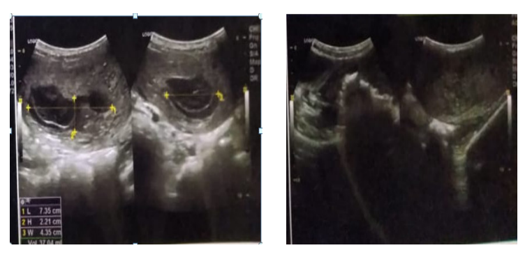
Fig1: Ultrasonography suggestive of multiple gestational sacs with no fetal pole seen

Initial laboratory investigations included normocytic hypochromic anemia with haemoglobin level of 8g/dl (normal range 12.0–16.0 g/dL), mean corpuscular volume of 81.1 (normal range 80–100 fL), and normal leucocyte count. Her TSH was low (<0.05uIU/m) and beta HCG value was found to be very high (>200000).