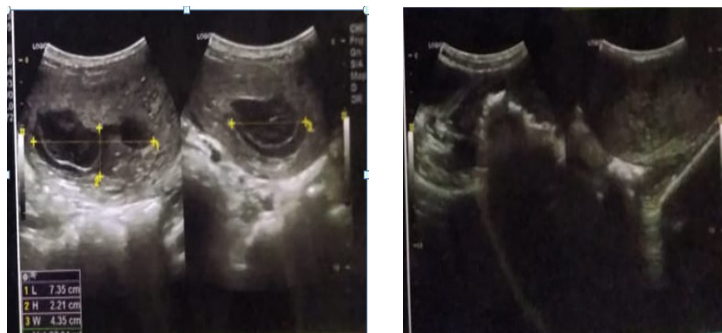
Fig1: Ultrasonography suggestive of multiple gestational sacs with no fetal pole seen

Initial laboratory investigations included normocytic hypochromic anemia with haemoglobin level of 8g/dl (normal range 12.0–16.0 g/dL), mean corpuscular volume of 81.1 (normal range 80–100 fL), and normal leucocyte count. Her TSH was low (<0.05uIU/m) and beta HCG value was found to be very high (>200000).