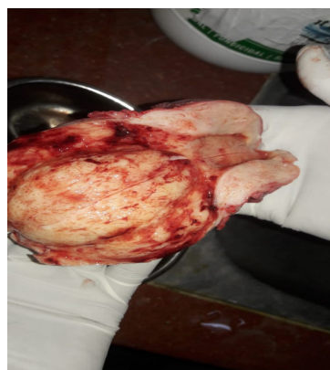
Figure-1: Uterine polyp with endometrial hyperplasia Figure-2: Uterine fibroid