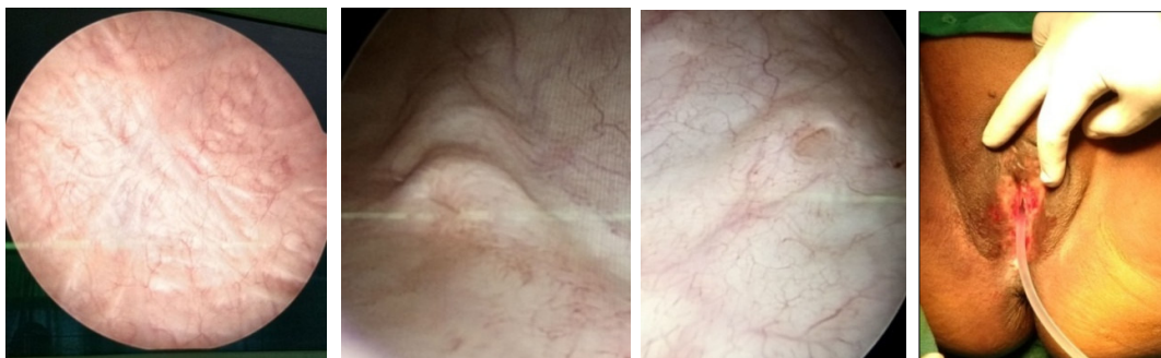
Figure 7: Cystoscopic examination showing increased bladder trabeculations.