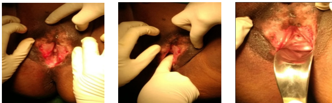
Figures 4-6: Postoperative view of the introitus following separation of labial adhesions; showing raw area, digital examination of vagina and per speculum examination.