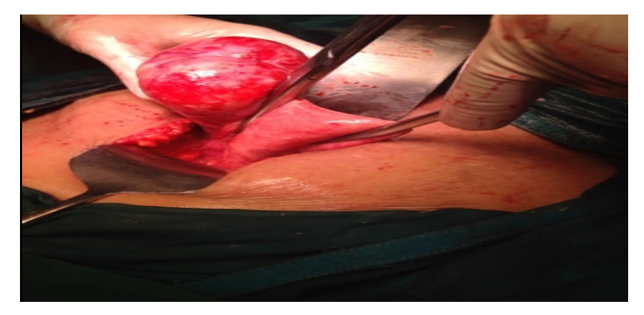
Fig.-1: Intraoperative picture of the tumour and diseased ovary

Patient was then taken up for surgery. Total abdominal hysterectomy with bilateral salpingo-oopherectomy under general anaesthesia was done. Intraoperatively, uterus was atrophied, right ovary showed a dermoid cyst of 8*9 cms that was adherent to the pouch of douglas. Left side showed a solid cyst teratoma of 3*2cms.